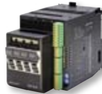
GFX4 (16,32,40A) [4 CHANNELS] FIELDBUS*