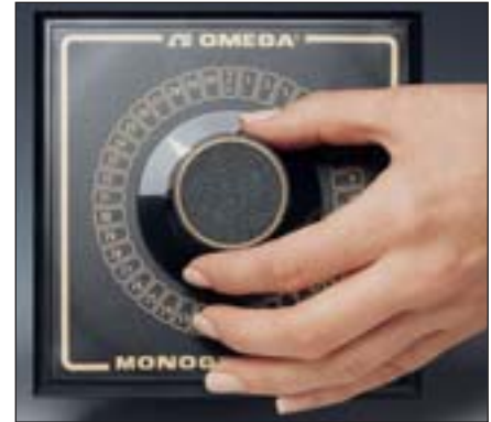
MONOGRAM® SERIES with gold plated contacts

Two pole SW and OSW series switches have a convenient "off" position. The "off" position may be left as an open circuit or shorted to keep spurious signals from registering on thermocouple instruments. Each pole is fully isolated. For quick and easy wiring, the terminals located at the rear of the switch are clearly marked.