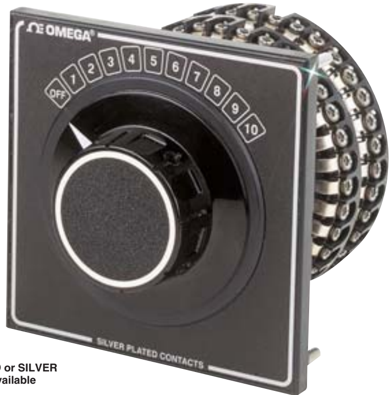
Choice of GOLD or SILVER Contacts Available