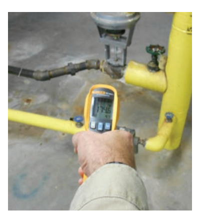
Viewing the temperature of the condensate line from a steam trap, to make sure it is functioning properly.

Steam trap failure can waste energy and cause improper HVAC system operation, resulting in a system freeze-up. With the Fluke 64 MAX IR Thermometer you can quickly identify a steam trap that has failed either open or closed.