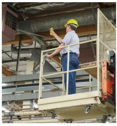
Identifying the temperature of ceilingmount equipment.

Almost all commercial air handling units provide a low temperature limit switch. To prevent the freeze-up of a water coil, the low temperature limit will stop the supply fan. In some cases the low temperature limit may be adjusted incorrectly. You can use the Fluke 64 MAX IR Thermometer to check the calibration of the low temperature limit and adjust as needed.