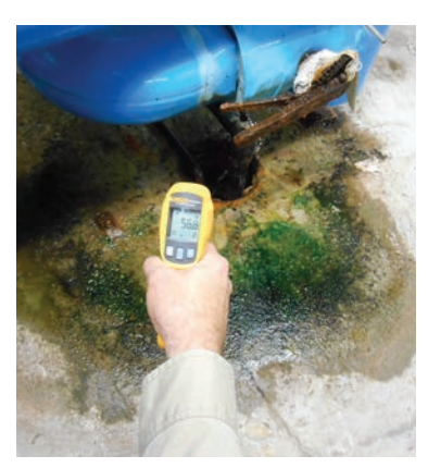
Taking the temperature of condensate as it goes into the drain

It is absolutely critical that products in coolers and freezers are maintained at the correct temperature. The Fluke 64 MAX IR Thermometer can quickly show that the products in a cooler or freezer are stored under the proper conditions. Since you can point the Fluke 64 MAX IR Thermometer at any products in the refrigerated space, it is superior to simple fixed location thermometers. And at the same time you check the product temperatures, you can check the evaporator coil and discharge air temperatures as well.