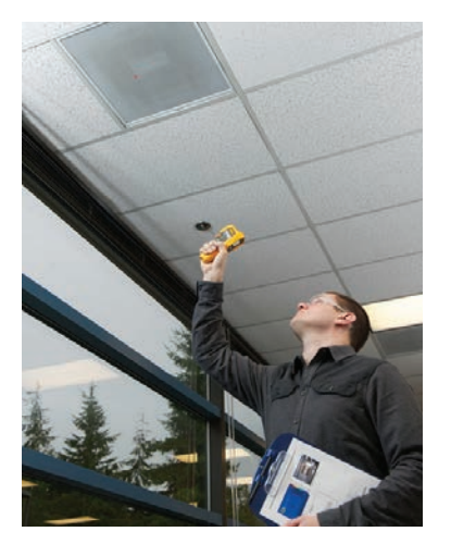
Checking the discharge temperature at air distribution ducts.

A room or space may have several air distribution ducts. One or more of them may be shut off. With the Fluke 64 MAX IR Thermometer you can identify those discharge ducts that are shut off, by checking the discharge temperatures of the different ducts and noting those that do not show the correct discharge temperature.