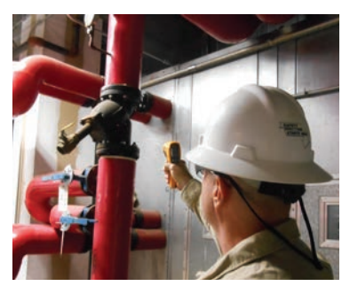
Looking at the water temperature at the inlet to an air handling unit coil.

Many commercial buildings use chilled water to cool the building. The chillers usually provide water at 42 to 44 °F (5.5 to 6.6 °C). Energy will be wasted if the chilled water temperature set point is incorrect. You can use the Fluke 64 MAX IR Thermometer to make sure the chilled water temperature provided to the building matches the set point.