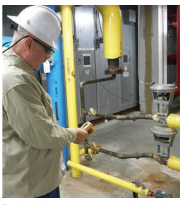
Testing the steam trap to see whether the trap has failed open and is wasting steam.