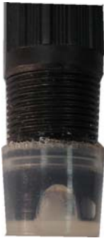
Soaker bottle ( Electrode protection bottle )

When pH readings are made infrequently, for example, several days or weeks apart, the electrode can be stored simply by replacing it in its soaker bottle. First, slide the cap onto the electrode, then insert the electrode into the bottle and firmly tighten the cap. If the solution in the soaker bottle is missing, fill the bottle with pH 4 buffer.