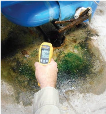
Taking the temperature of condensate as it goes into the drain.

It is absolutely critical that products in coolers and freezers are maintained at the correct temperature. The Fluke 64 MAX IR Thermometer can quickly show that the products in a cooler or freezer are stored under the proper conditions. Since you can point the Fluke 64 MAX IR Thermometer at any products in the refrigerated space, it is superior to simple fixed location thermometers. And at the same time you check the product temperatures, you can check the evaporator coil and discharge air temperatures as well.