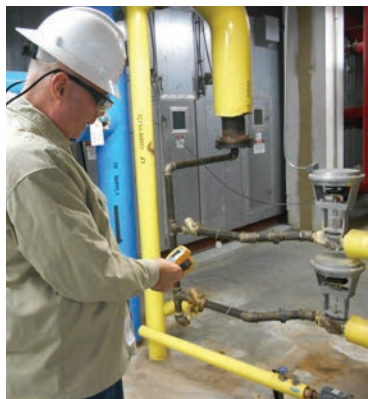
Testing the steam trap to see whether the trap has failed open and is wasting steam.