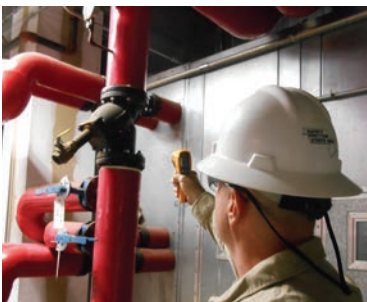
Looking at the water temperature at the inlet to an air handling unit coil.

Many commercial buildings use chilled water to cool the building. The chillers usually provide water at 42 to 44 °F (5.5 to 6.6 °C). Energy will be wasted if the chilled water temperature set point is incorrect. You can use the Fluke 64 MAX IR Thermometer to make sure the chilled water temperature provided to the building matches the set point.