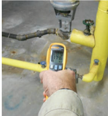
Viewing the temperature of the condensate line from a steam trap, to make sure it is functioning properly.

Steam trap failure can waste energy and cause improper HVAC system operation, resulting in a system freeze-up. With the Fluke 64 MAX IR Thermometer you can quickly identify a steam trap that has failed either open or closed.