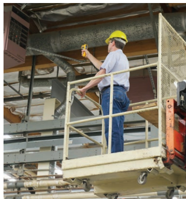
Identifying the temperature of ceiling-mount equipment.

Almost all commercial air handling units provide a low temperature limit switch. To prevent the freeze-up of a water coil, the low temperature limit will stop the supply fan. In some cases the low temperature limit may be adjusted incorrectly. You can use the Fluke 64 MAX IR Thermometer to check the calibration of the low temperature limit and adjust as needed.