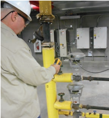
Measuring the steam temperature at the inlet to the humidifier valve.