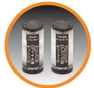
33%RH / 75%RH Humidity Standard (OPTIONAL)

* The specifications and other information in this catalogue are subject to change without prior notice