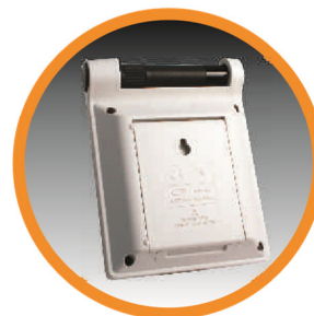
Back stand with hanging support.