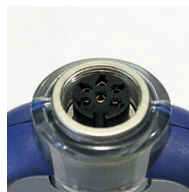
Secure Lumberg Connector

Rugged Waterproof Polycarbonate Case with BioCote® Antimicrobial Protection