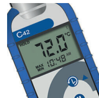
Max/Min feature recalls highest and lowest reading