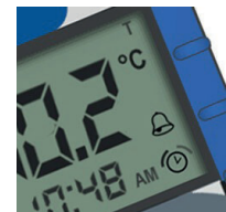
Count-down timer and alarms